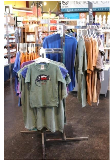
Four Way Clothing Rack