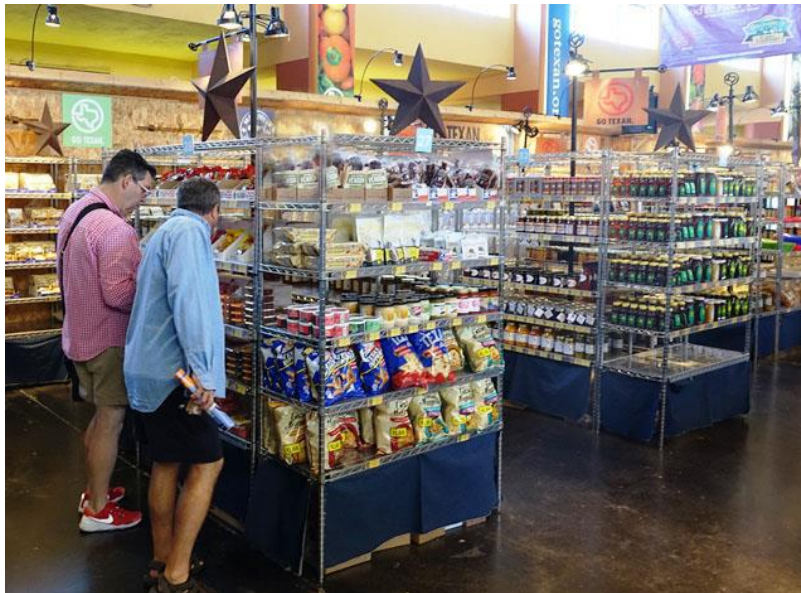
Entire Unit End Caps place products on the end of a shelving aisle.