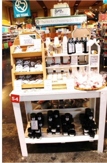
Bird House I Side A (SOLD) , Side B