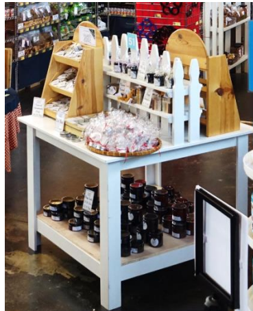
Bird House II Side A (SOLD) , Side B